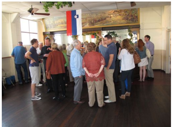
Conversation and libation.